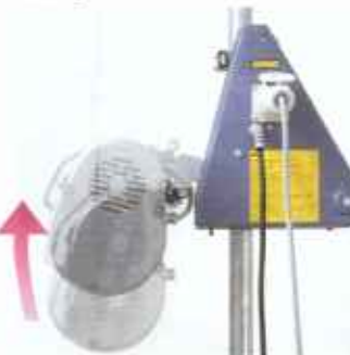
The integrated limit switch stops the upward function • as soon as the swivel arm is reached • in case of overloading • in case of getting caught at the scaffold