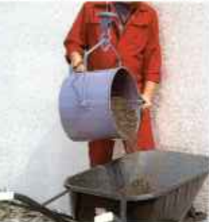
Lifting container with locking mechanism, capacity 35 l. Lifting container with locking mechanism, capacity 65 l. See large picture above.