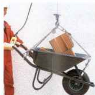
Adjustable chain sling for lifting of wheelbarrows.