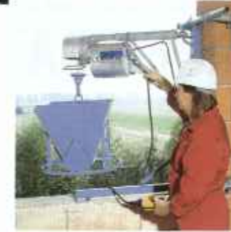
Practical fixing devices and well-thought out load carrying units for versatile use.

The light-weight swivel arm hoists GEDA-STAR 150 and GEDA-MINI 75/150 with German drive unit in a sturdy aluminium housing are the ideal partners for any lifting job. Featuring four fixing devices and versatile load carrying units these reliable swivel arm hoists can be used anywhere up to a lifting height of 50 m. As the electric winch unit of the GEDA-STAR 150 can be separated from the swivel arm, one person alone can erect the hoist or adjust the working radius of the swivel arm. The load capacity of the GEDA-MINI 75/150 can be doubled to 150 kg by using a pulley block.