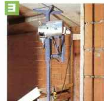
The floor to ceiling support can be extended from 230-325 cm. Due to an additional lockable swivel arm it has a very large working radius up to 155 cm and can even be used at very small windows (min. width approx. 70 cm) due to the two joints. The swivel arm can also be adjusted in height.