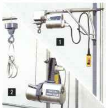
Rope hoists: ■ Swivel arm hoists ■ Scaffolding hoists