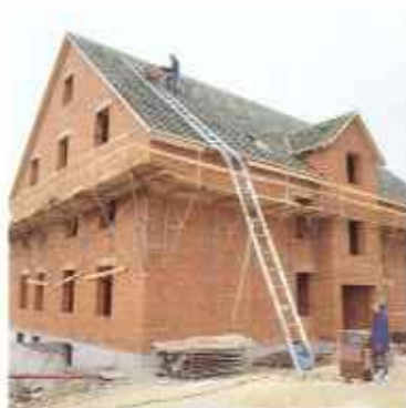
Inclined lifts with steel wire rope