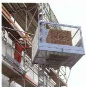
Rack and pinion hoists with steel mast