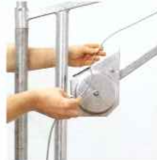
Fitting the wire rope around the swivel arm pulley is very easy and requires no dismantling.