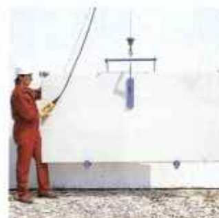
Adjustable board pick-up frame, for max. 125 cm high boards.