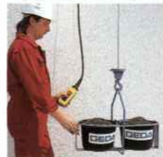
Bucket hanger for two buckets; suitable for all round and oval buckets.