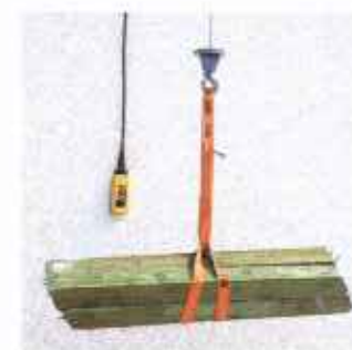
1.5 m long lifting sling for all bulky building materials.