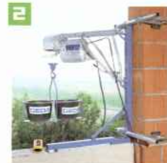
The window clamp is adjustable for wall thicknesses from 16-50 cm and is a practical fixing device for most window openings. In case of existing window posts the bearing points can be moved.