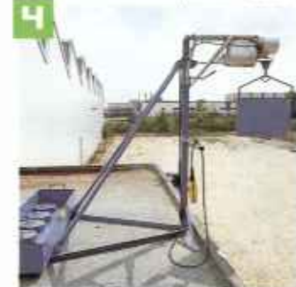
The free-standing tripod with ballast container for flat roofs and open floors can be disassembled for easy transport.