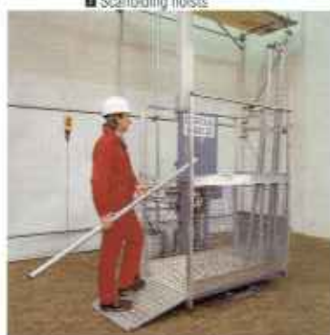
Rack and pinion hoists with aluminium mast