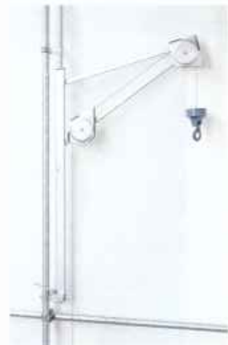
The standard swivel arm of the GEDA-MAXI 120/150 S can be fixed at any scaffold level.

Two lifting speeds, overload protection and slack rope device plus the many load carrying devices make these fast scaffold hoists also ideal for the efficient and safe transport of building materials.