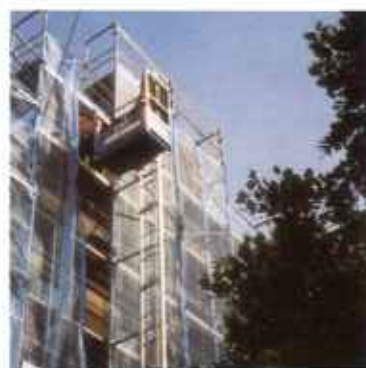
Inclined and vertical lifts with rack and pinion