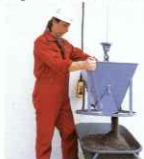
Mortar skip with bottom discharge, capacity 65 l.