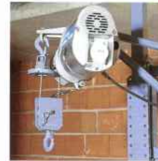
The load capacity of the GEDA-MINI 75/150 can be doubled to 150 kg by means of the pulley block.