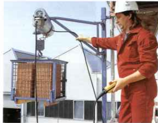
GEDA swivel arm hoists can help save a lot of time and energy on site: Ball bearing hooks and pulley block act as twist preventer.