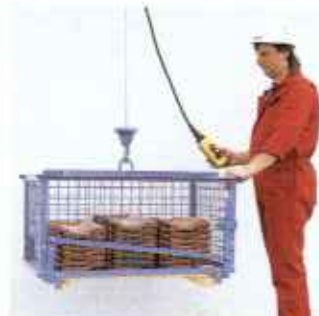
Delivery cage, inside dimensions 92 x 57 x 44 cm, with pallet and cage locking mechanism.