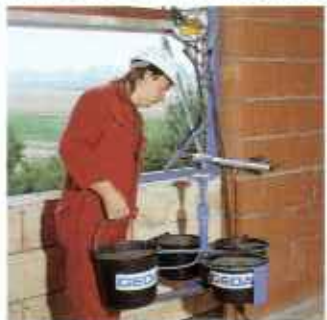
Bucket hanger for four buckets; suitable for all round and oval buckets.