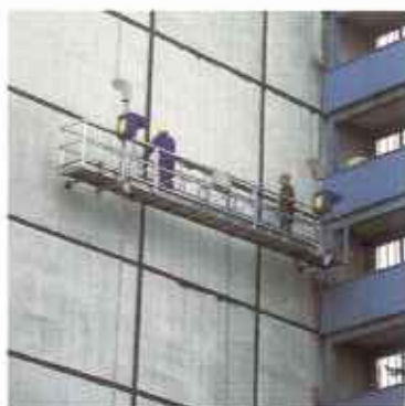
Suspended working platforms