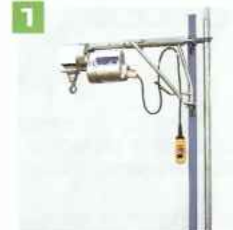
The scaffold clamp for all 1 1/2" steel scaffold tubes is suitable for all GEDA swivel arm hoists.