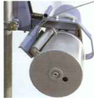
The motor stops in case of slack rope formation, the wire rope remains taut on the drum.