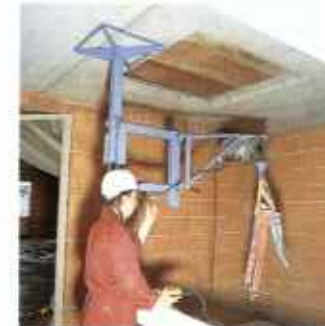
The floor to ceiling support also allows use under difficult conditions (e.g. in staircases).