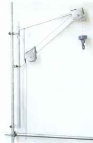
The swivel arm of the GEDA-MINI 60 S can be fixed in front of a scaffold tube.