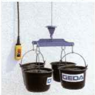
Bucket ring with snaplinks for 4 buckets; can also be used for other building materials.