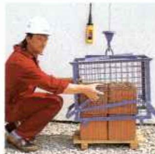
Brick cage, inside dimensions 62 x 32 x 50 cm, with pallet and practical cage locking mechanism.